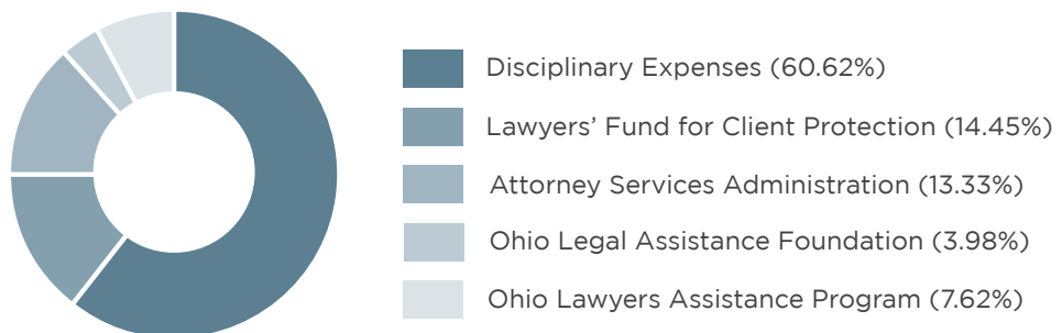
Figure 2—Fiscal Year 2019 Allocations

The Court approved a grant of $400,000 to the Ohio Legal Assistance Foundation for its work in supporting the delivery of civil legal services to indigent persons. The Court also awarded a grant of $765,000 to the Ohio Lawyers Assistance Program for alcohol, substance abuse, and mental health intervention programs. Together, these grants represent 3.98% and 7.62%, respectively, of the fund allocations for Fiscal Year 2019.